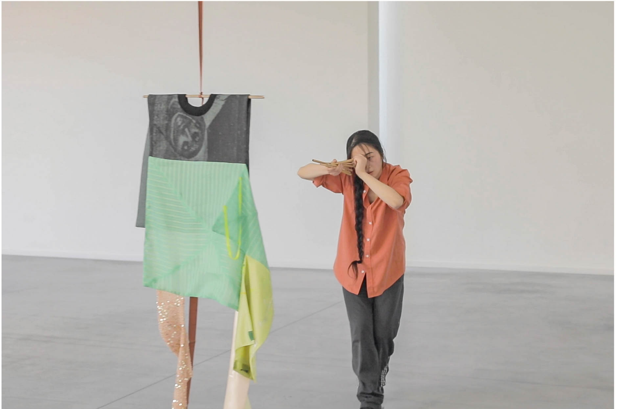
It is part XXX of an ensemble, and this ensemble is no longer necessarily ceremonial, 2022 installation view Museum Dhondt-Dhaenens, Sint-Martens Latem