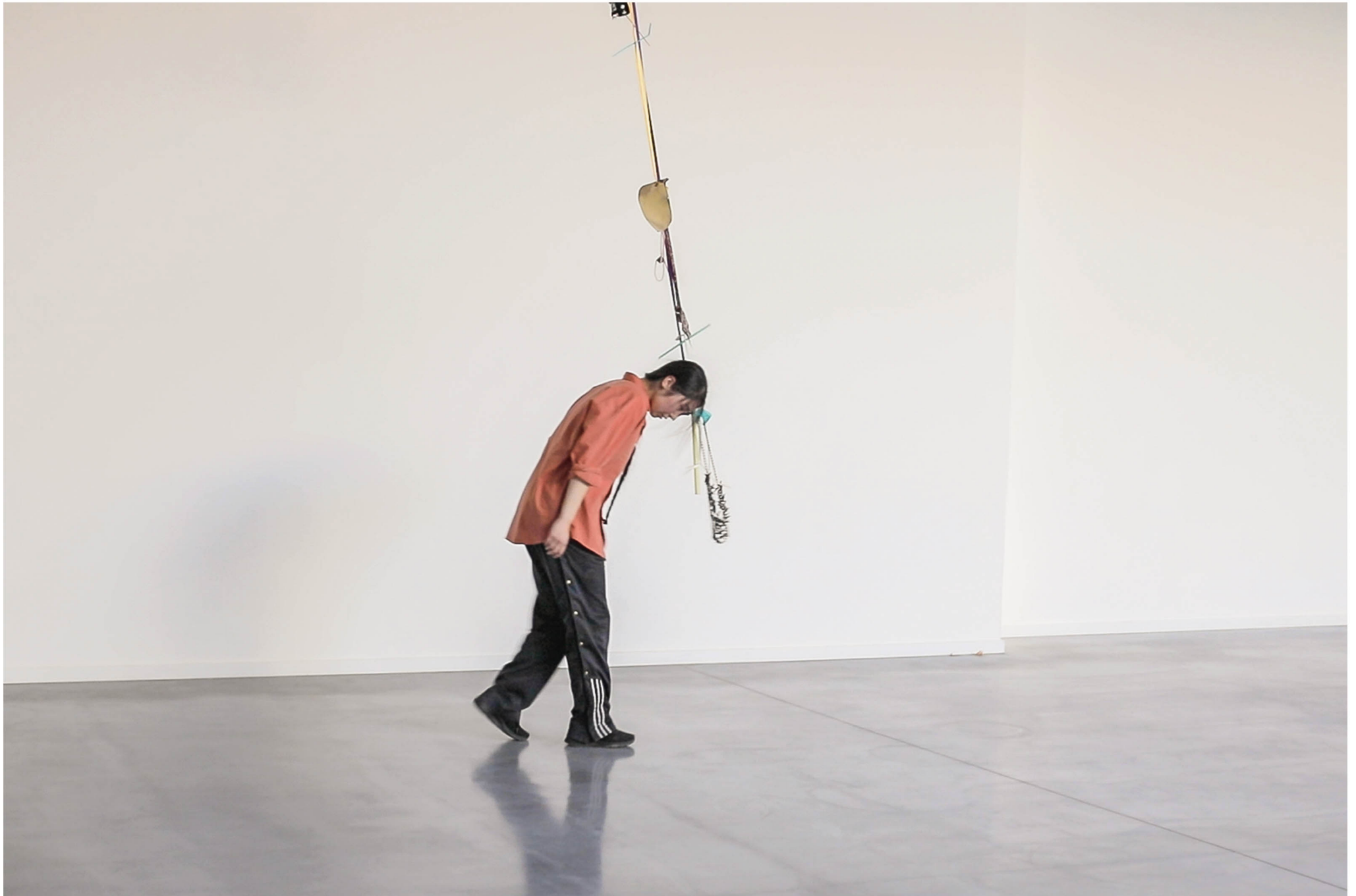
It is part XXX of an ensemble, and this ensemble is no longer necessarily ceremonial, 2022 installation view Museum Dhondt-Dhaenens, Sint-Martens Latem