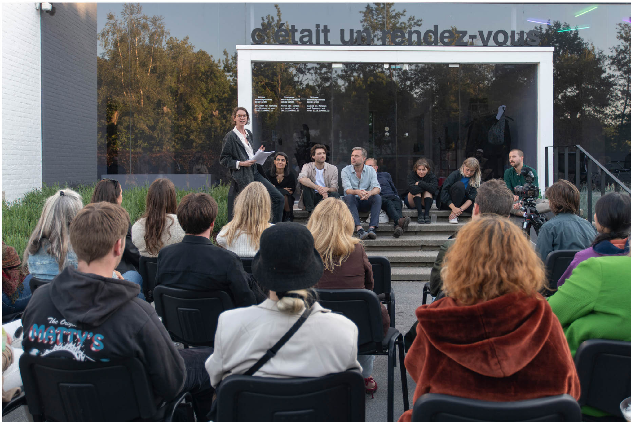
It is part XXX of an ensemble, and this ensemble is no longer necessarily ceremonial, 2022 installation view Museum Dhondt-Dhaenens, Sint-Martens Latem