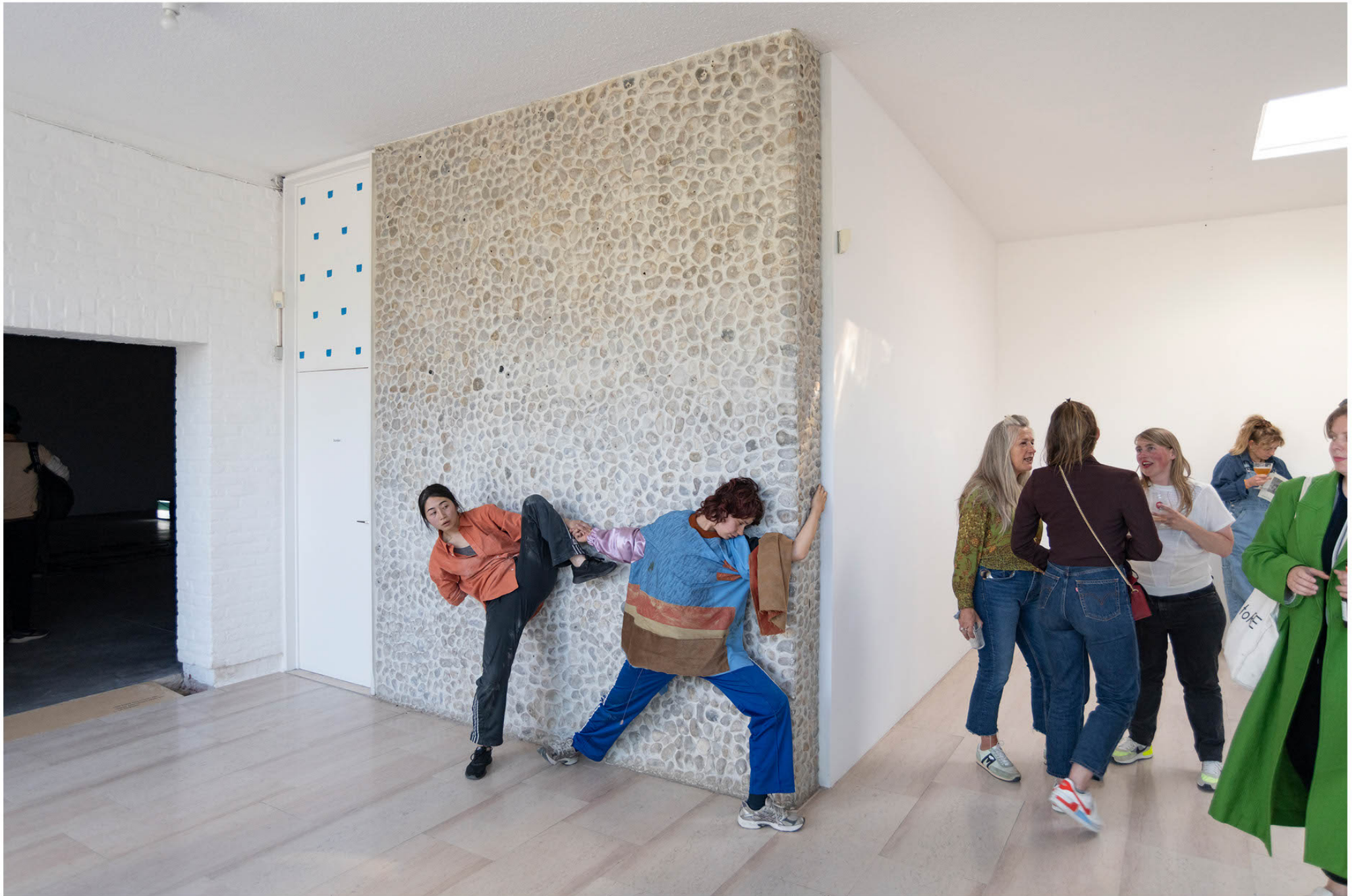
It is part XXX of an ensemble, and this ensemble is no longer necessarily ceremonial, 2022 installation view Museum Dhondt-Dhaenens, Sint-Martens Latem