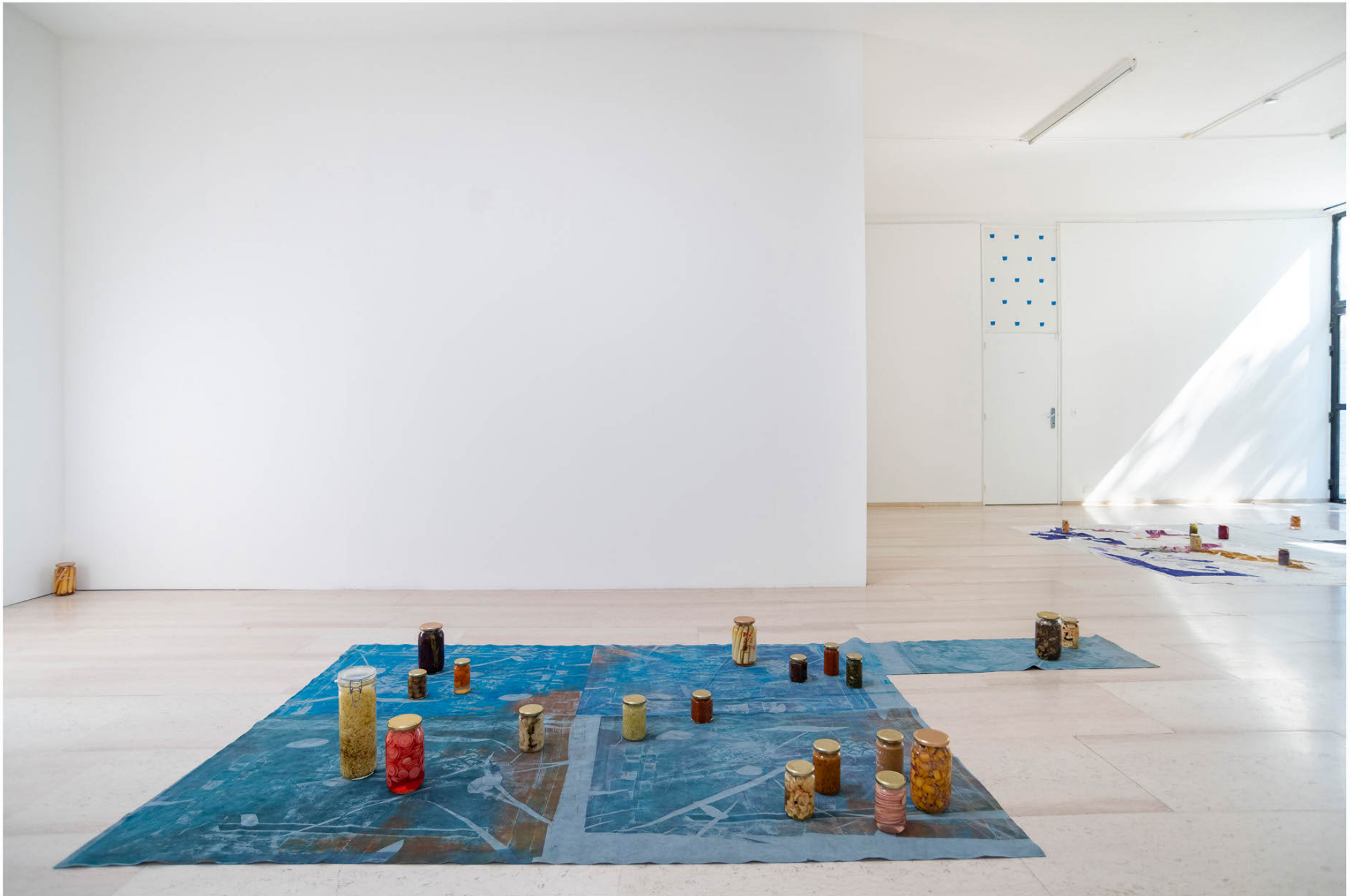
It is part XXX of an ensemble, and this ensemble is no longer necessarily ceremonial , 2022 installation view Museum Dhondt-Dhaenens, Sint-Martens Latem