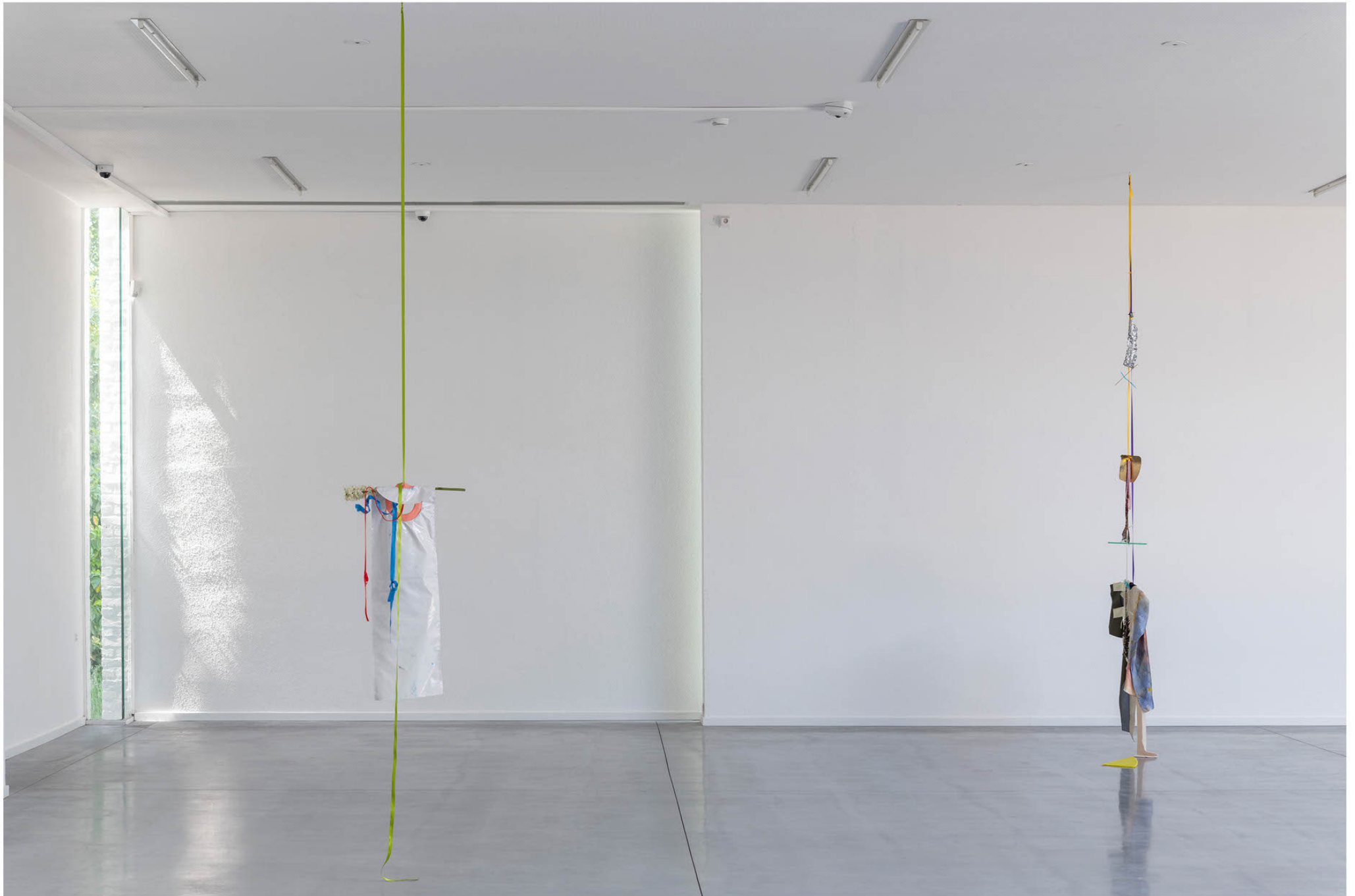
It is part XXX of an ensemble, and this ensemble is no longer necessarily ceremonial, 2022 installation view Museum Dhondt-Dhaenens, Sint-Martens Latem