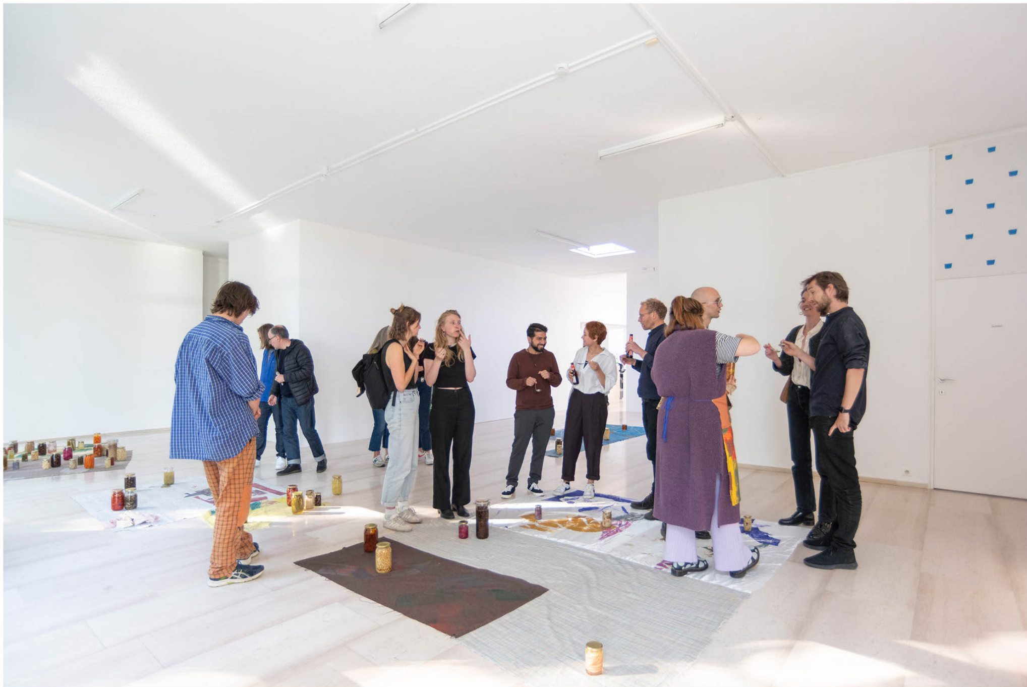
It is part XXX of an ensemble, and this ensemble is no longer necessarily ceremonial, 2022 installation view Museum Dhondt-Dhaenens, Sint-Martens Latem