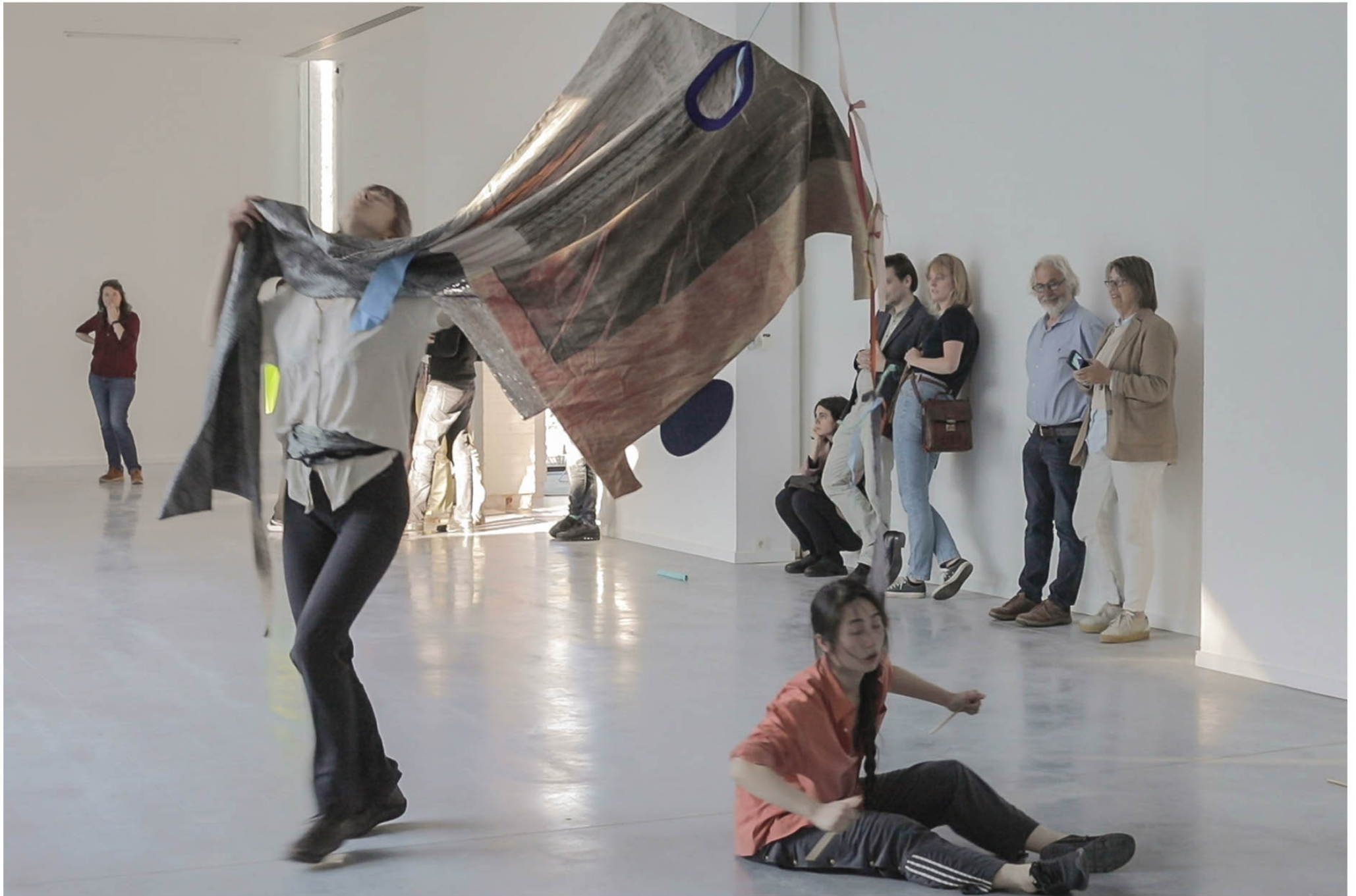
It is part XXX of an ensemble, and this ensemble is no longer necessarily ceremonial, 2022 installation view Museum Dhondt-Dhaenens, Sint-Martens Latem