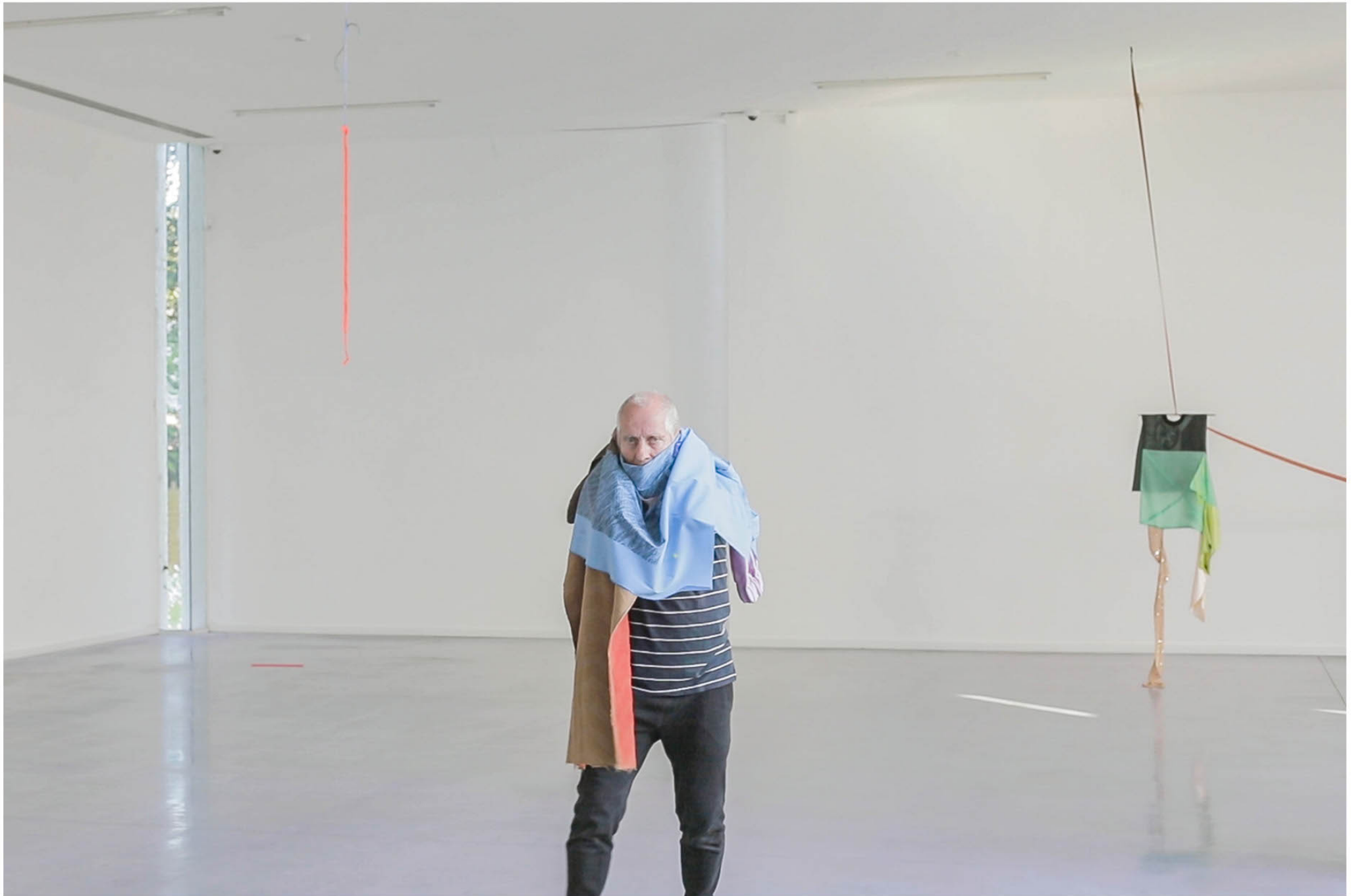
It is part XXX of an ensemble, and this ensemble is no longer necessarily ceremonial, 2022 installation view Museum Dhondt-Dhaenens, Sint-Martens Latem