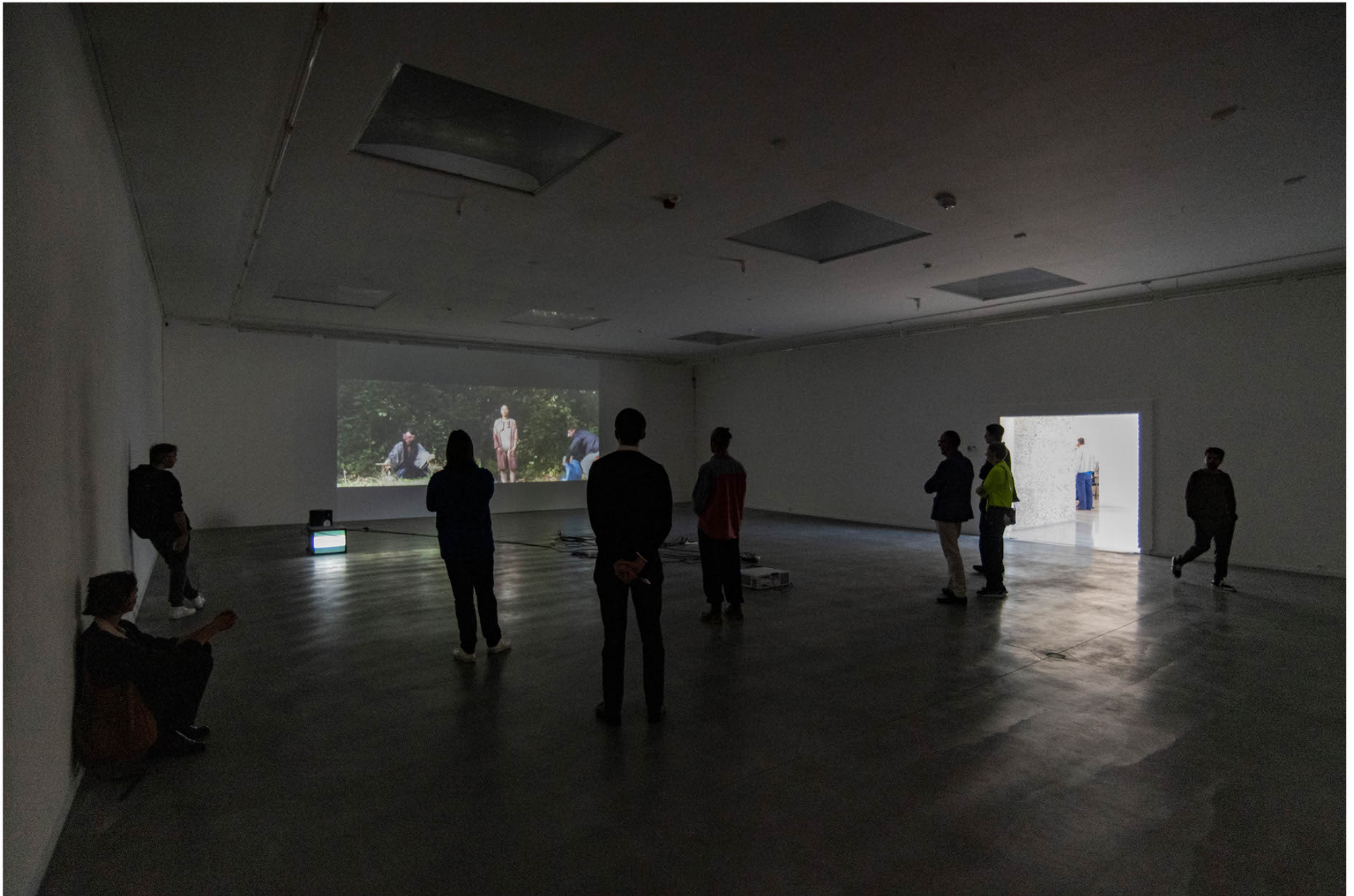
It is part XXX of an ensemble, and this ensemble is no longer necessarily ceremonial , 2022 installation view Museum Dhondt-Dhaenens, Sint-Martens Latem