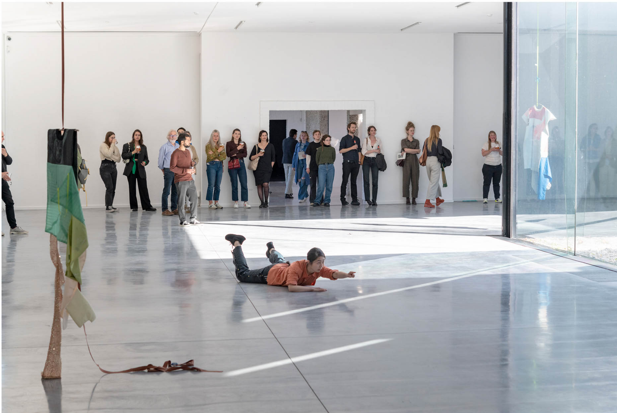
It is part XXX of an ensemble, and this ensemble is no longer necessarily ceremonial, 2022 installation view Museum Dhondt-Dhaenens, Sint-Martens Latem