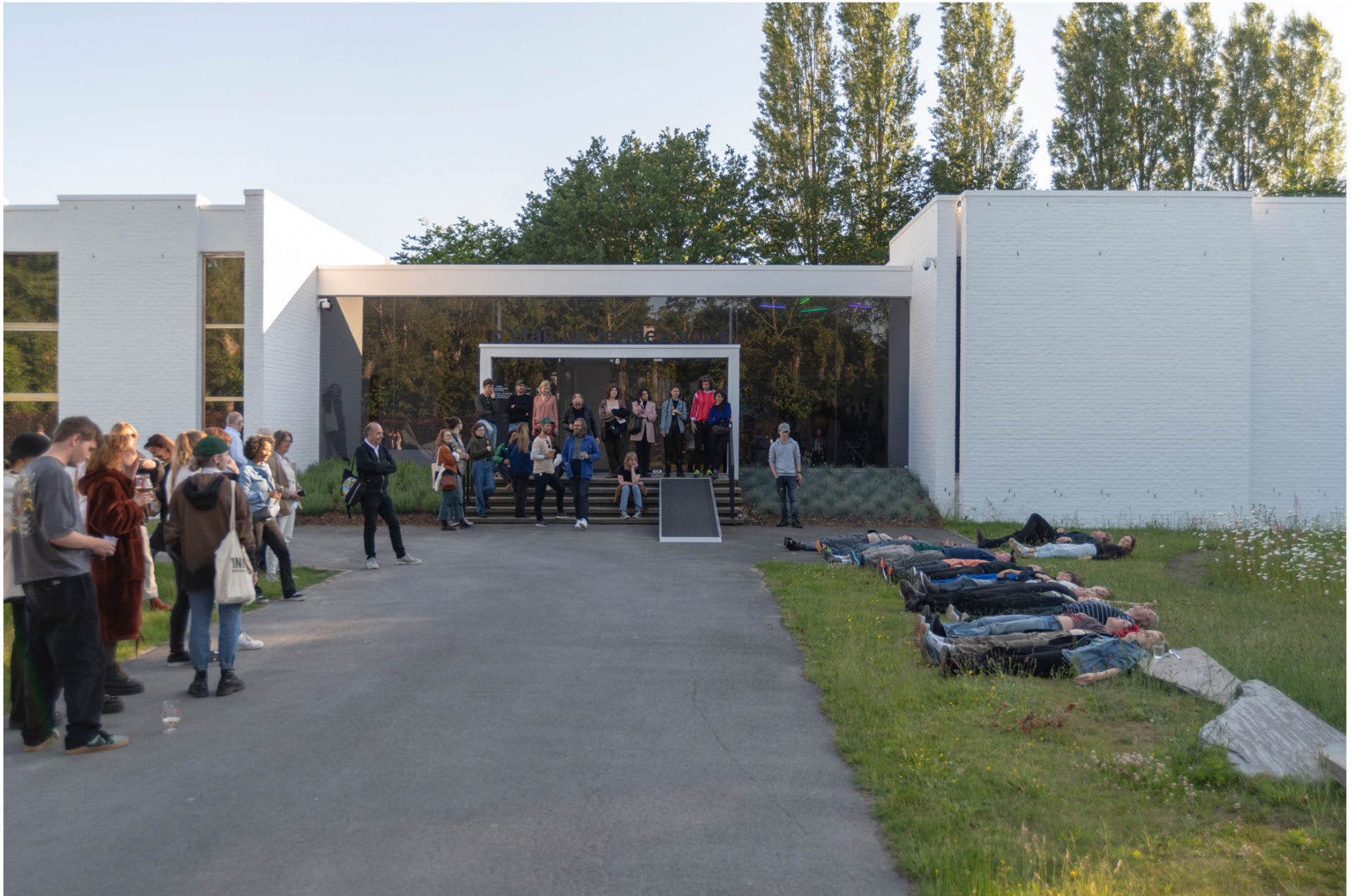
It is part XXX of an ensemble, and this ensemble is no longer necessarily ceremonial, 2022 installation view Museum Dhondt-Dhaenens, Sint-Martens Latem