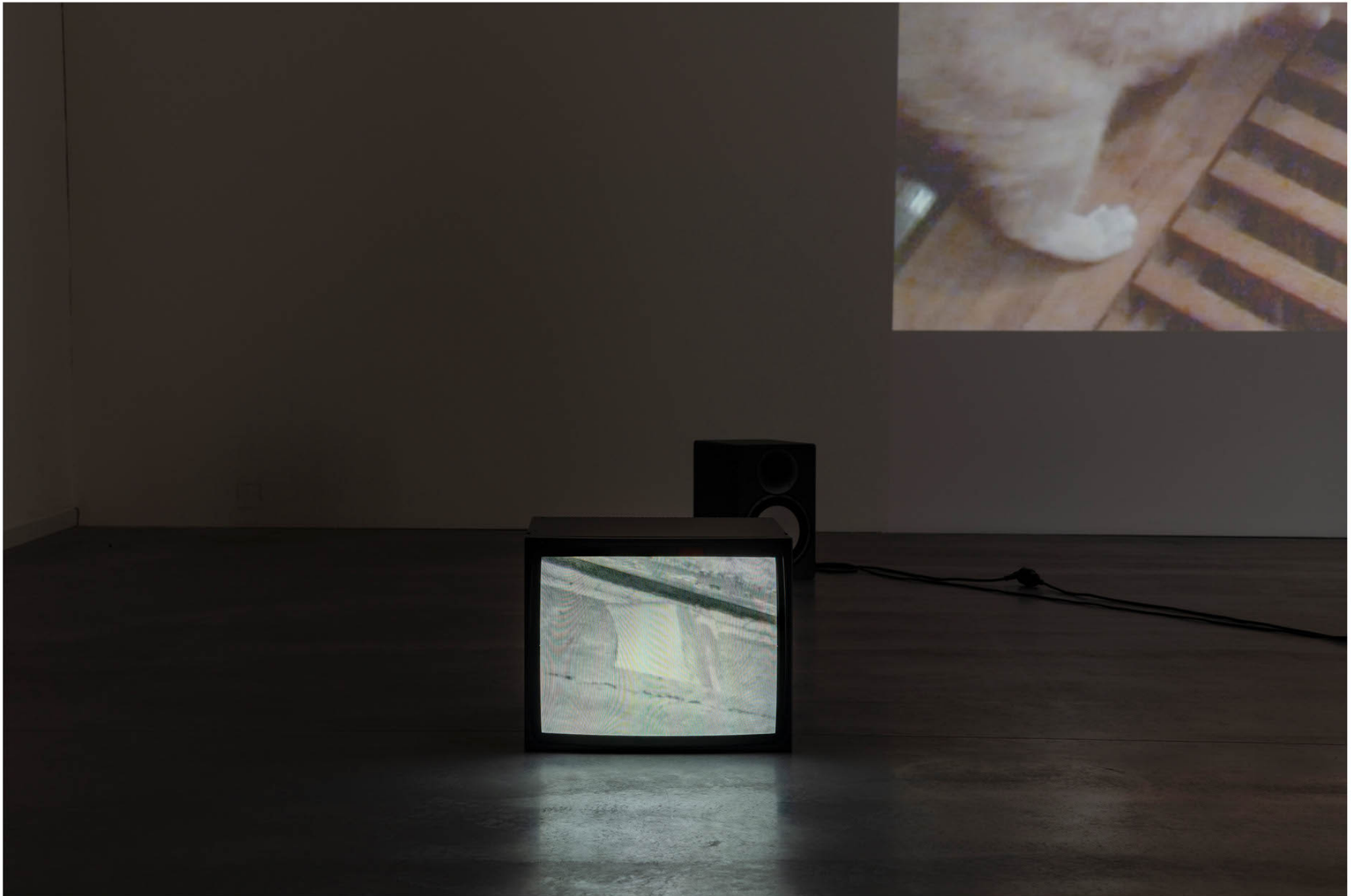
It is part XXX of an ensemble, and this ensemble is no longer necessarily ceremonial , 2022 installation view Museum Dhondt-Dhaenens, Sint-Martens Latem