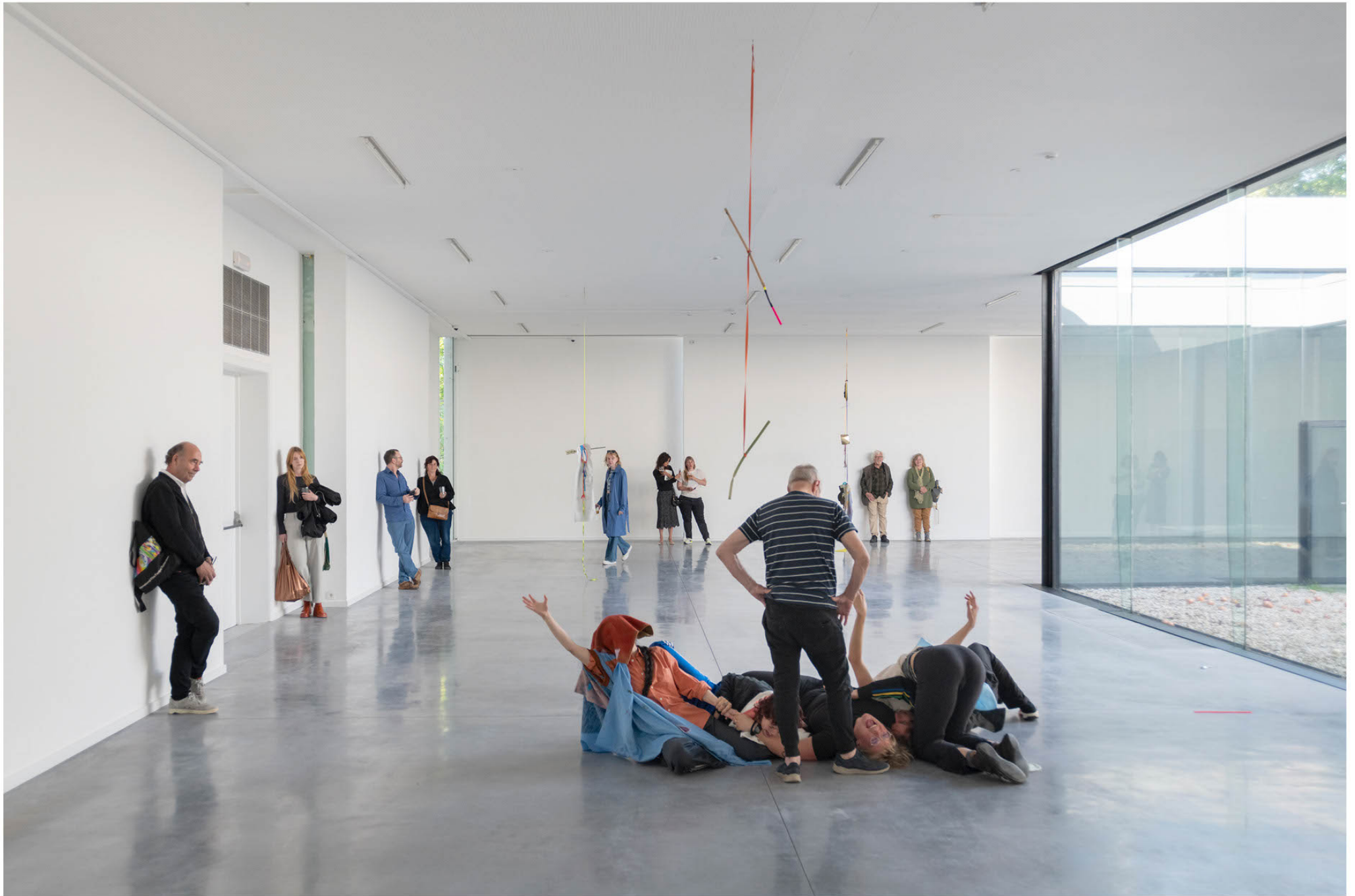
It is part XXX of an ensemble, and this ensemble is no longer necessarily ceremonial, 2022 installation view Museum Dhondt-Dhaenens, Sint-Martens Latem