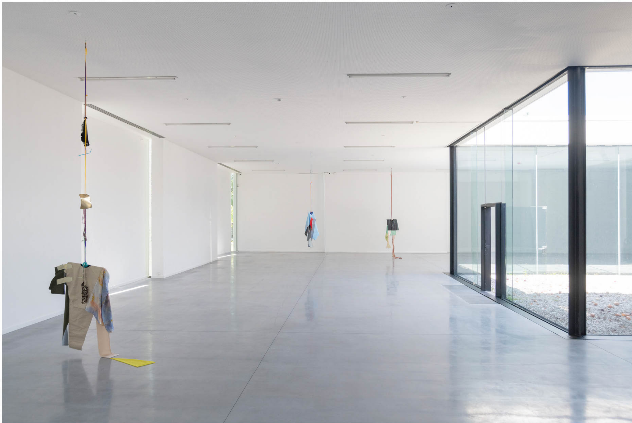
It is part XXX of an ensemble, and this ensemble is no longer necessarily ceremonial , 2022 installation view Museum Dhondt-Dhaenens, Sint-Martens Latem