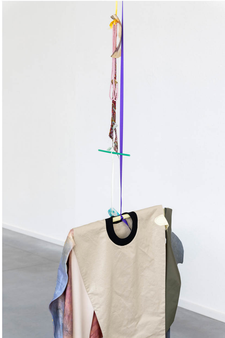
It is part XXX of an ensemble, and this ensemble is no longer necessarily ceremonial, 2022 installation view Museum Dhondt-Dhaenens, Sint-Martens Latem