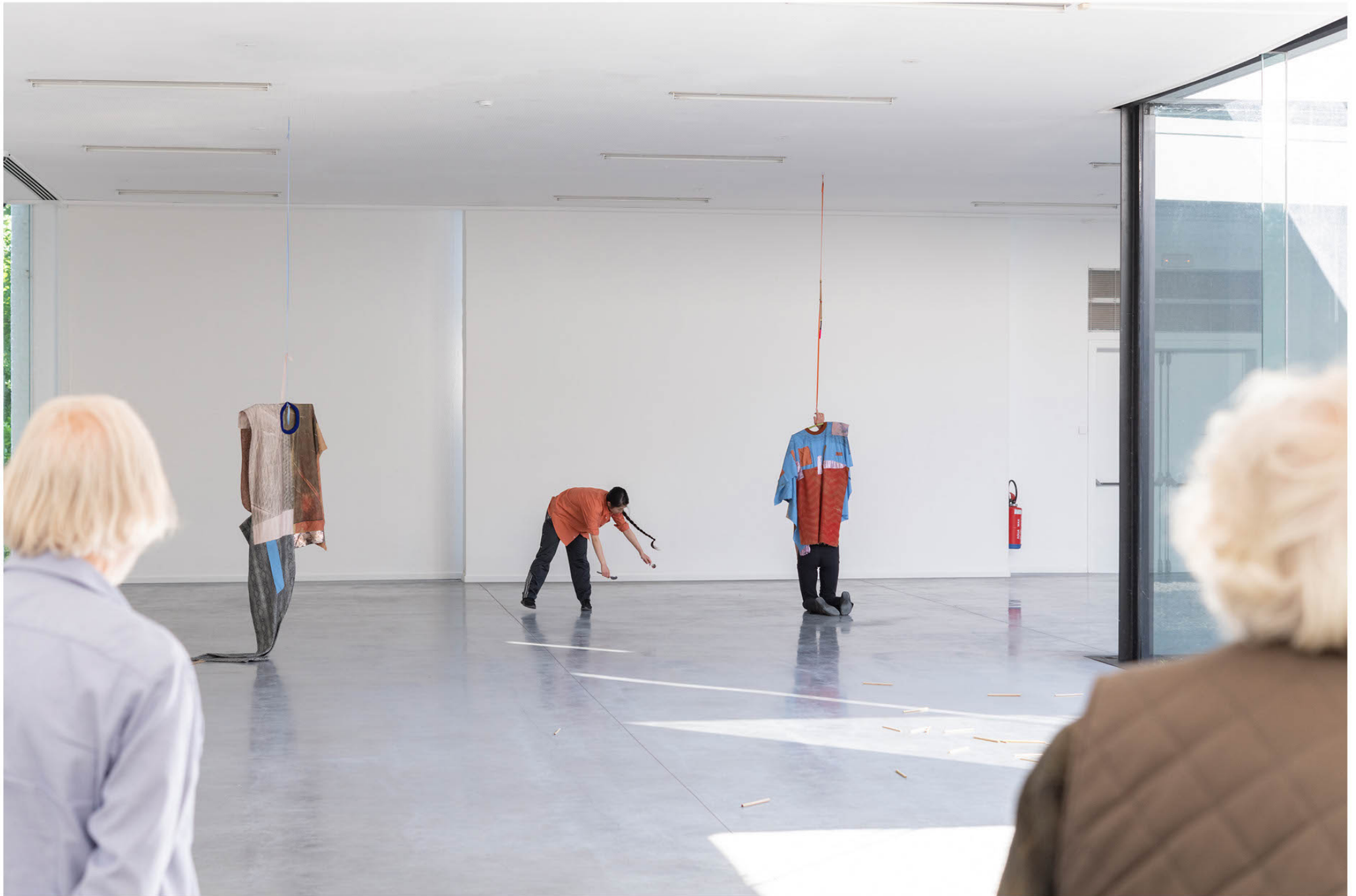
It is part XXX of an ensemble, and this ensemble is no longer necessarily ceremonial , 2022 installation view Museum Dhondt-Dhaenens, Sint-Martens Latem