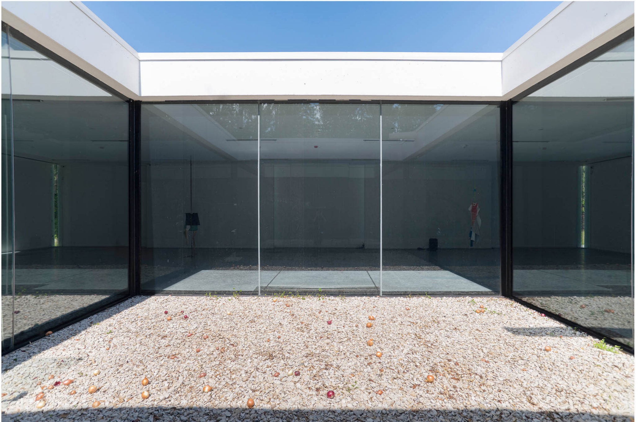
It is part XXX of an ensemble, and this ensemble is no longer necessarily ceremonial, 2022 installation view Museum Dhondt-Dhaenens, Sint-Martens Latem