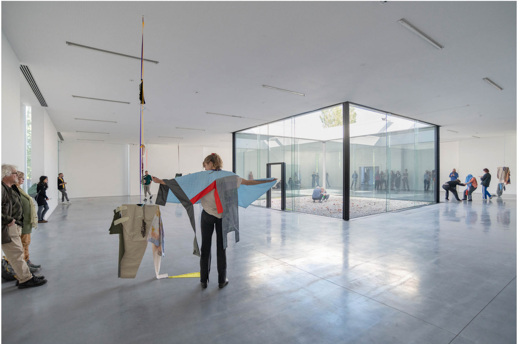
It is part XXX of an ensemble, and this ensemble is no longer necessarily ceremonial, 2022 installation view Museum Dhondt-Dhaenens, Sint-Martens Latem