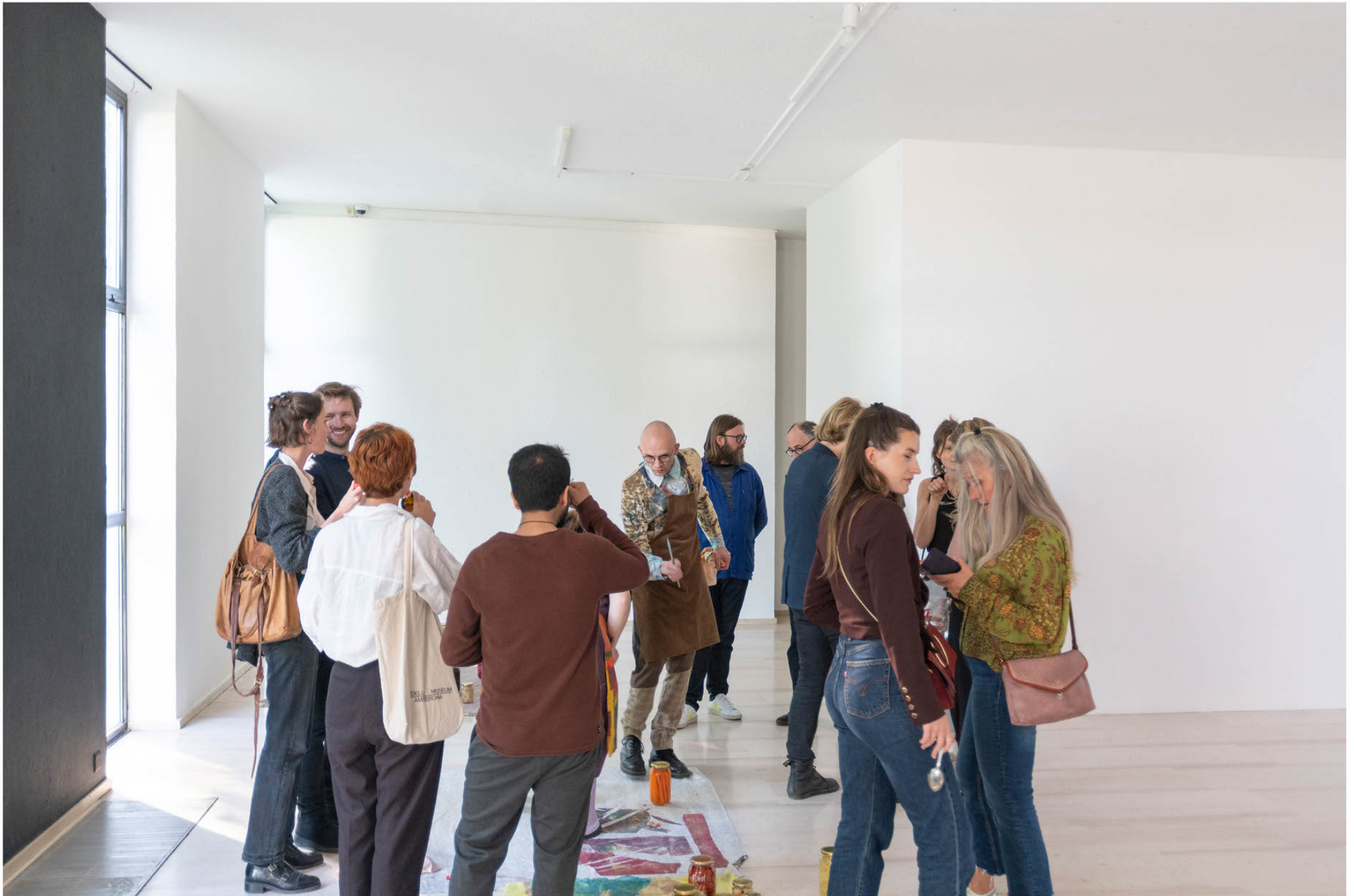
It is part XXX of an ensemble, and this ensemble is no longer necessarily ceremonial, 2022 installation view Museum Dhondt-Dhaenens, Sint-Martens Latem