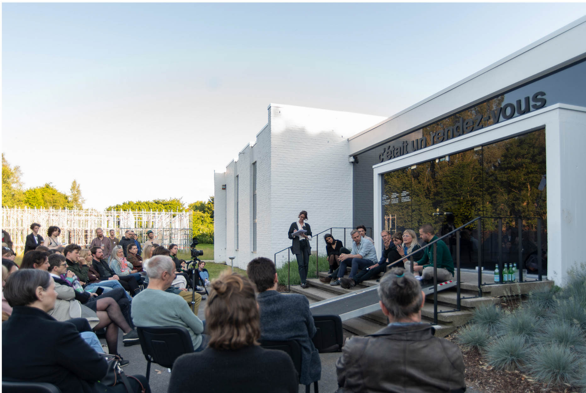
It is part XXX of an ensemble, and this ensemble is no longer necessarily ceremonial, 2022 installation view Museum Dhondt-Dhaenens, Sint-Martens Latem