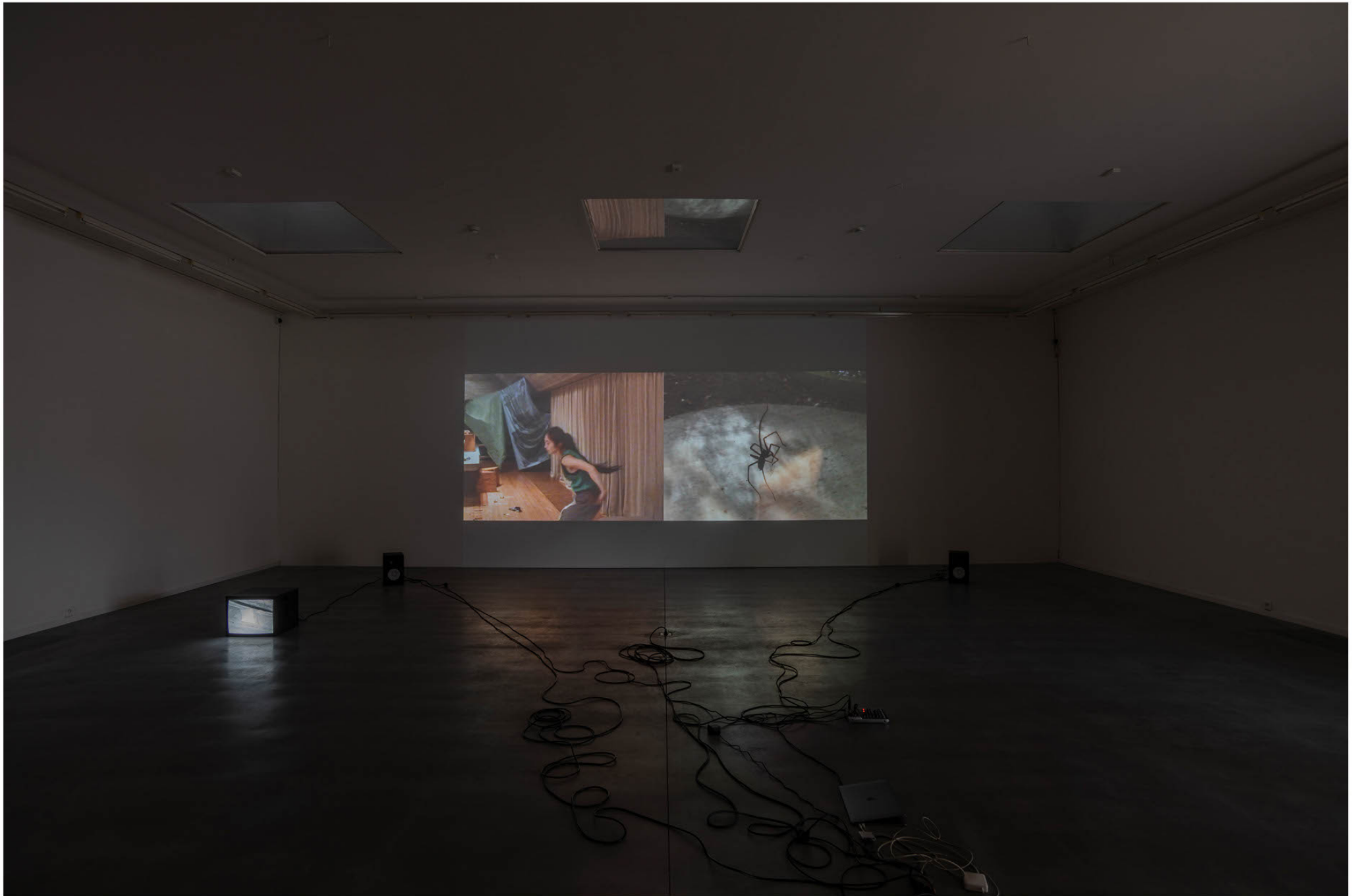
It is part XXX of an ensemble, and this ensemble is no longer necessarily ceremonial, 2022 installation view Museum Dhondt-Dhaenens, Sint-Martens Latem