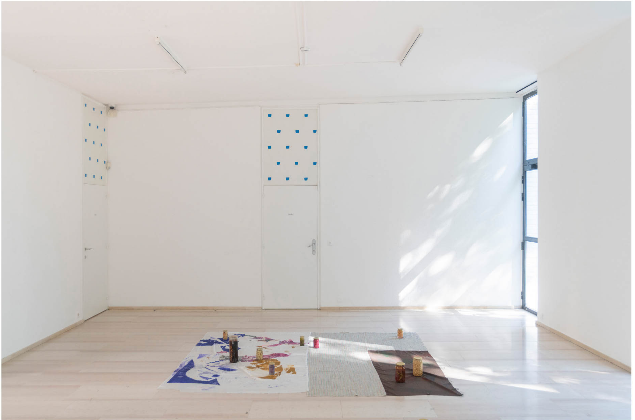
It is part XXX of an ensemble, and this ensemble is no longer necessarily ceremonial, 2022 installation view Museum Dhondt-Dhaenens, Sint-Martens Latem