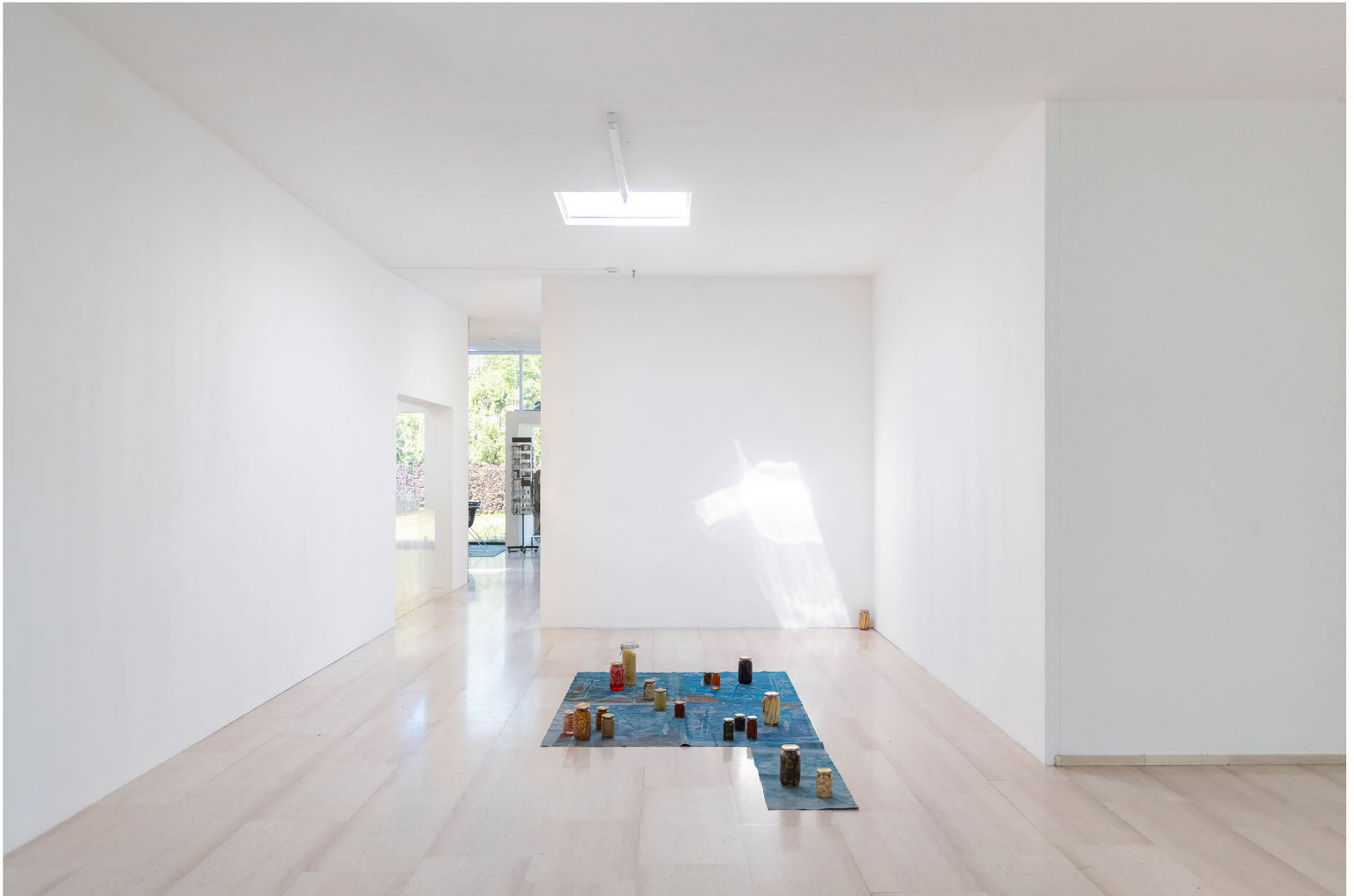
It is part XXX of an ensemble, and this ensemble is no longer necessarily ceremonial, 2022 installation view Museum Dhondt-Dhaenens, Sint-Martens Latem