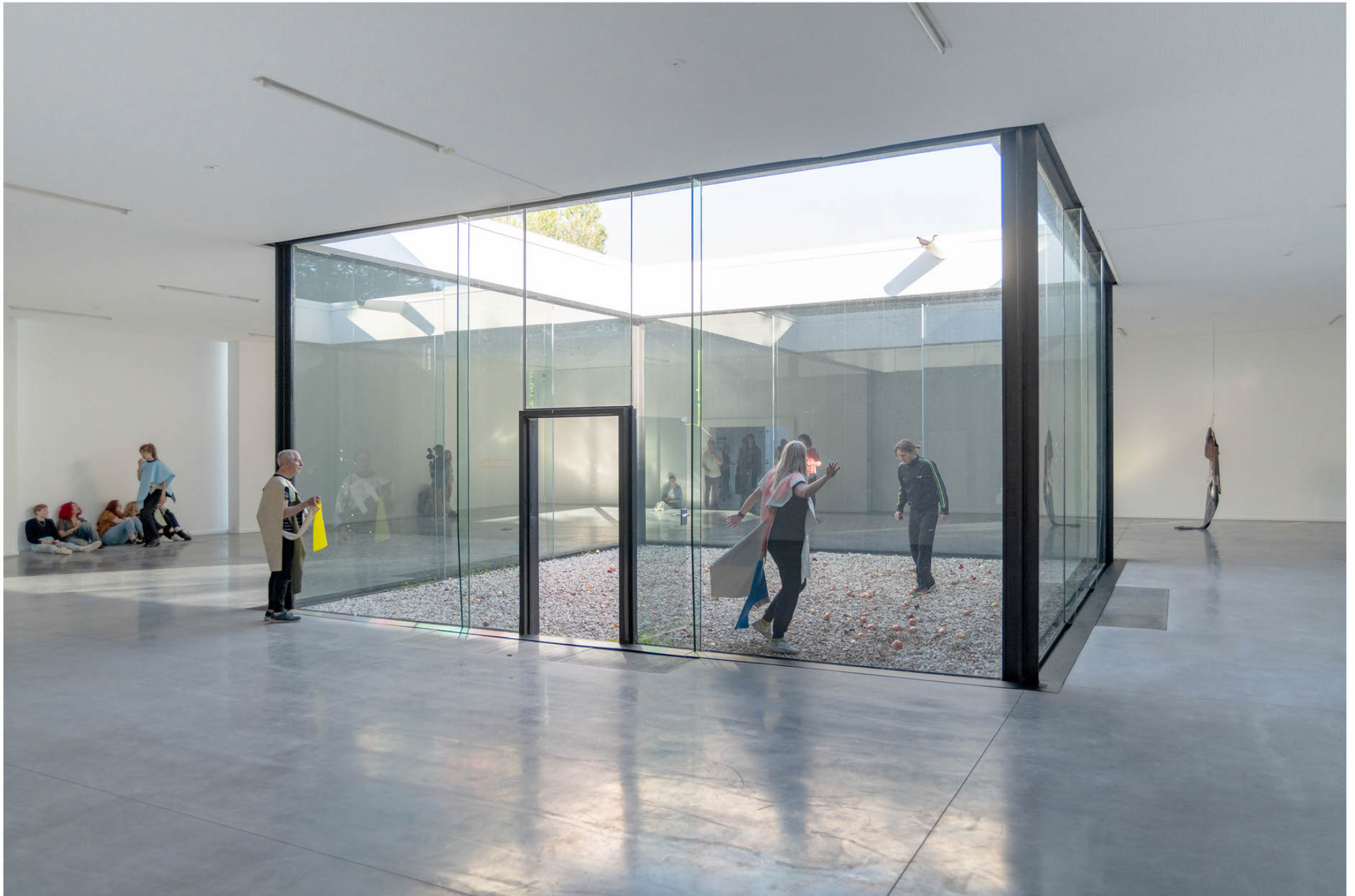
It is part XXX of an ensemble, and this ensemble is no longer necessarily ceremonial , 2022 installation view Museum Dhondt-Dhaenens, Sint-Martens Latem