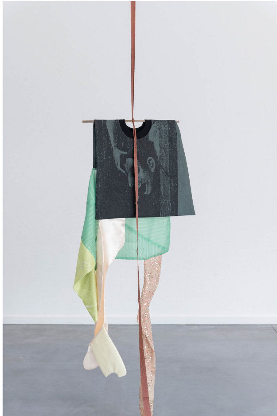
It is part XXX of an ensemble, and this ensemble is no longer necessarily ceremonial , 2022 installation view Museum Dhondt-Dhaenens, Sint-Martens Latem