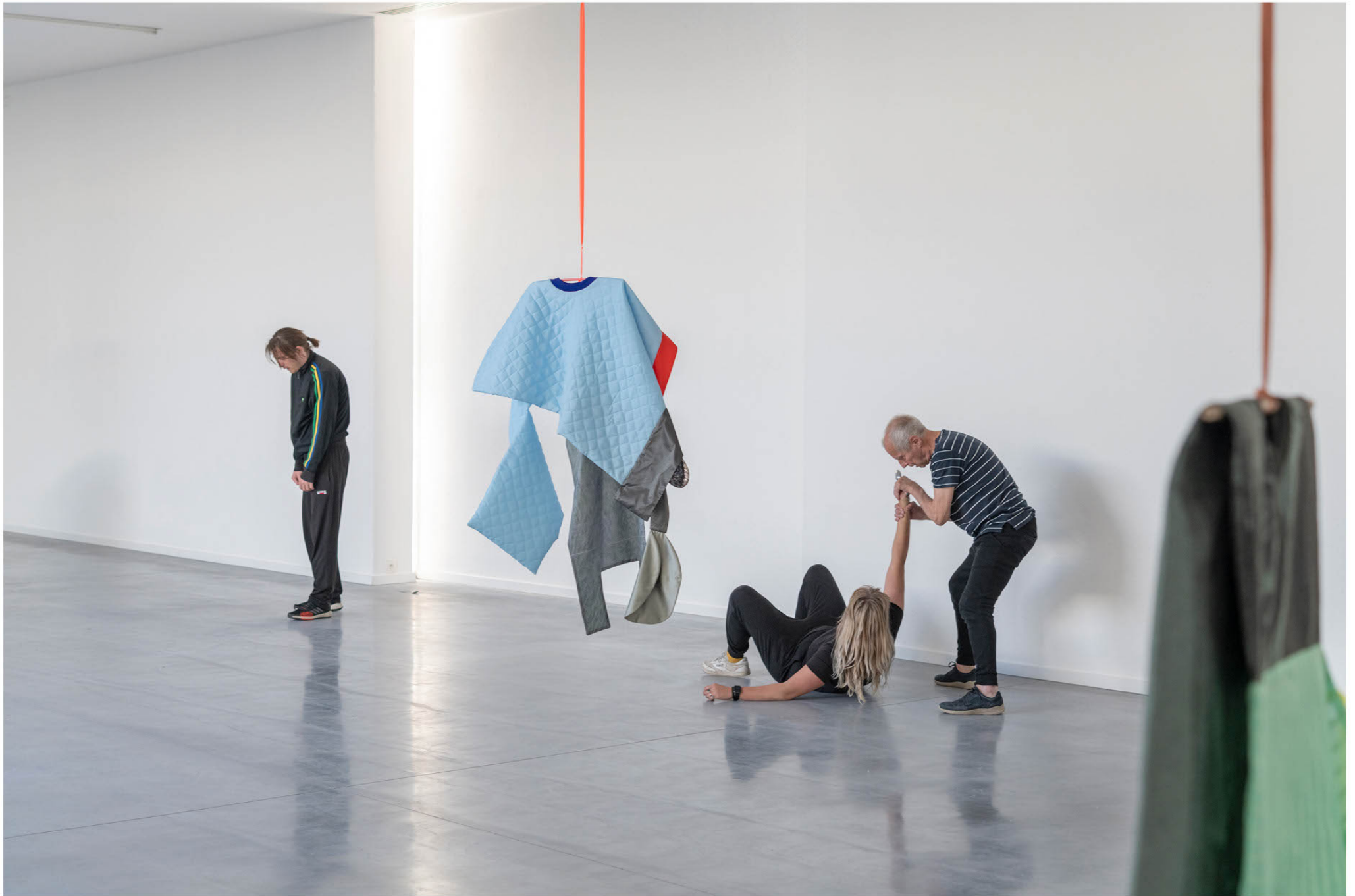
It is part XXX of an ensemble, and this ensemble is no longer necessarily ceremonial , 2022 installation view Museum Dhondt-Dhaenens, Sint-Martens Latem