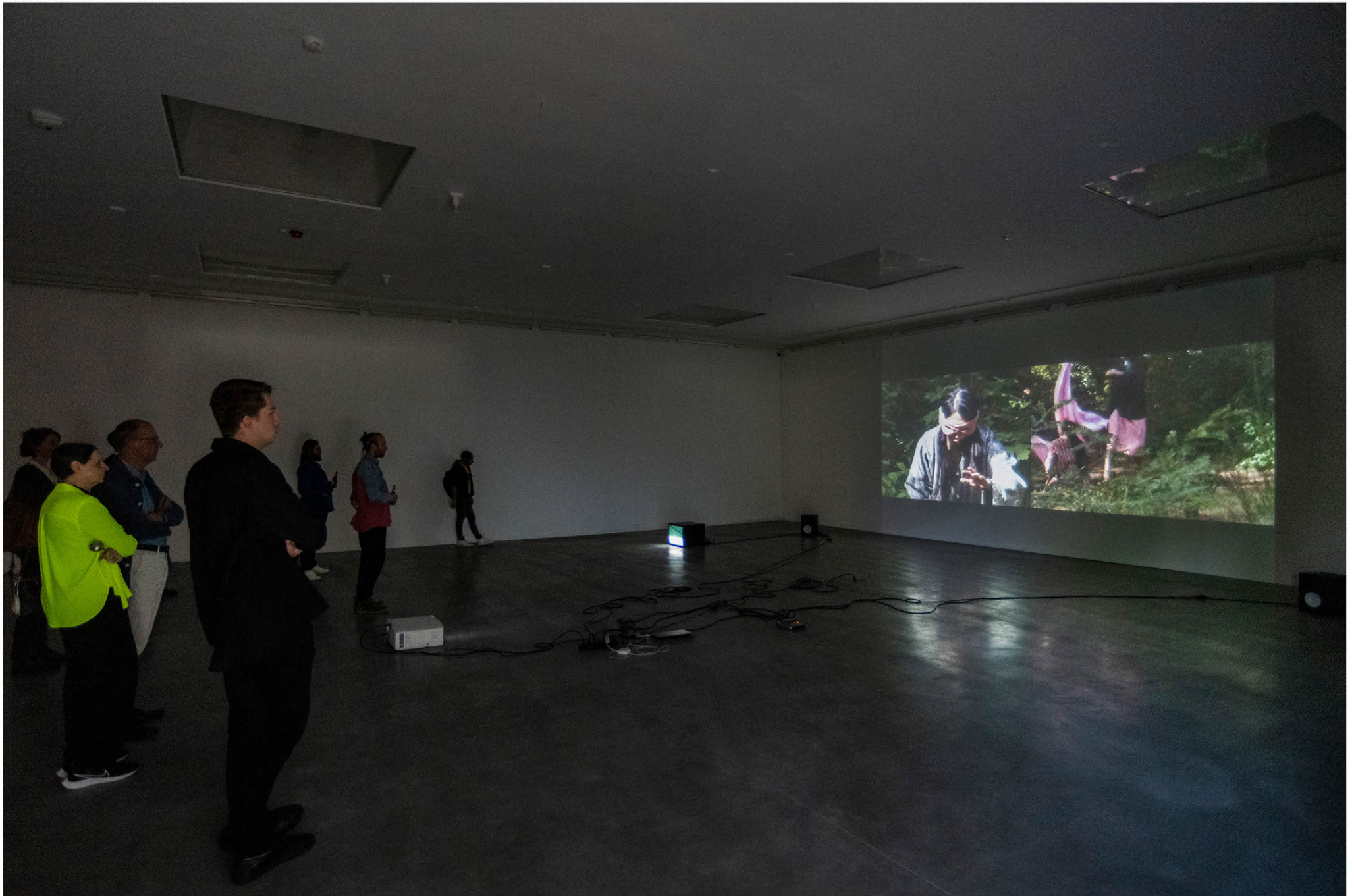
It is part XXX of an ensemble, and this ensemble is no longer necessarily ceremonial , 2022 installation view Museum Dhondt-Dhaenens, Sint-Martens Latem