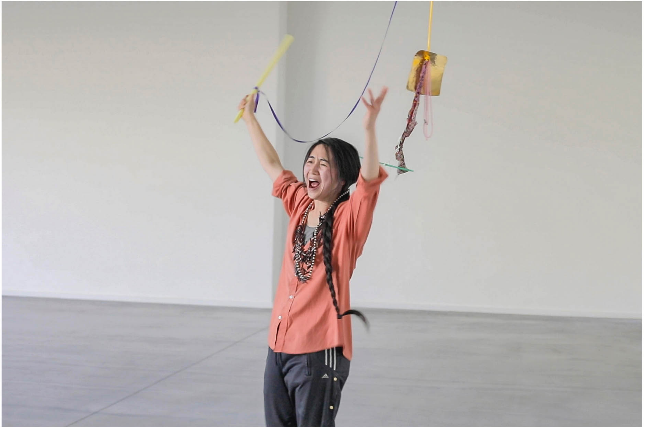
It is part XXX of an ensemble, and this ensemble is no longer necessarily ceremonial, 2022 installation view Museum Dhondt-Dhaenens, Sint-Martens Latem